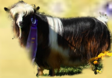
Master Champion Flying J Farms Secret Weapon