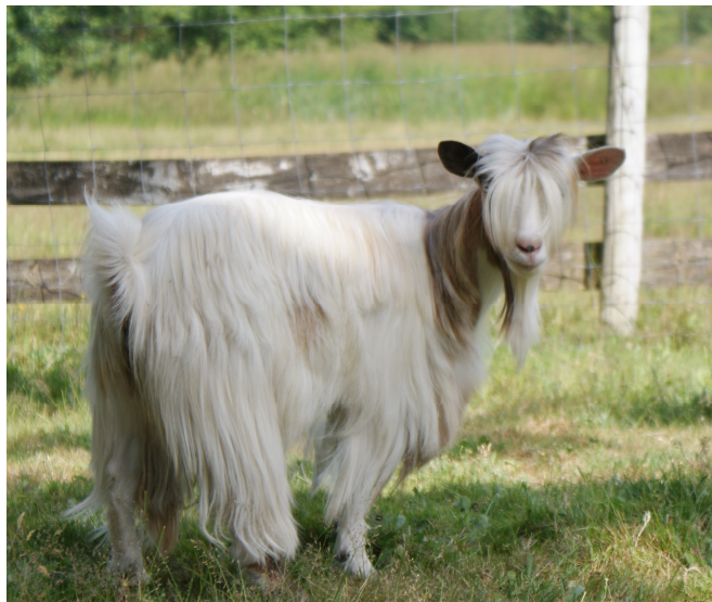
Pictured above: "San Sujo Rosebud", a yearling doe