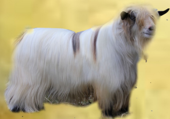
Master Champion Bells Goats Patch