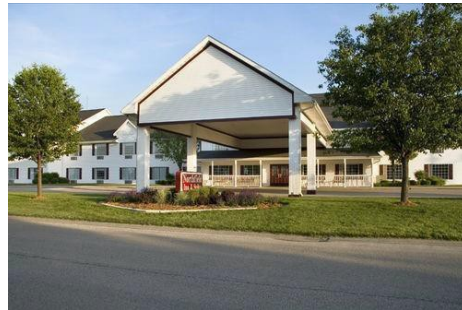
Northfield Inn and Suites 3280 Northfield Dr Springfield, IL 62702 (217) 523-7900

We are excited to announce our host hotels for this event are the Ramada Springfield North and the Northfield Inn and Suites. Each hotel has a "Courtesy Block" of 10 rooms (standard rooms- double queens or kings) set aside for our show. To book your room in the "Courtesy Block", call the hotel directly at the number above and ask for the "MGR Goat Show" room block and special rate. There is a discounted rate of $89 plus tax per room for Friday June 1. Reservations will need to be made by May 1, 2018 to secure your room and special rate.